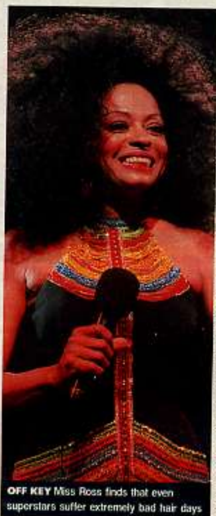
OFF KEY Miss Ross finds that even superstars suffer extremely bad hair days