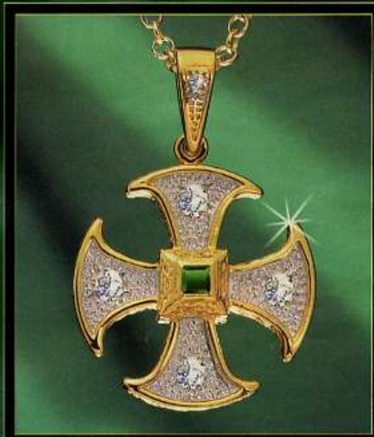
Pendant shown larger than actual size of 1 1/2" (40mm) high.

Inspired by the story of St. Augustine on the 1400th anniversary of his arrival at Canterbury