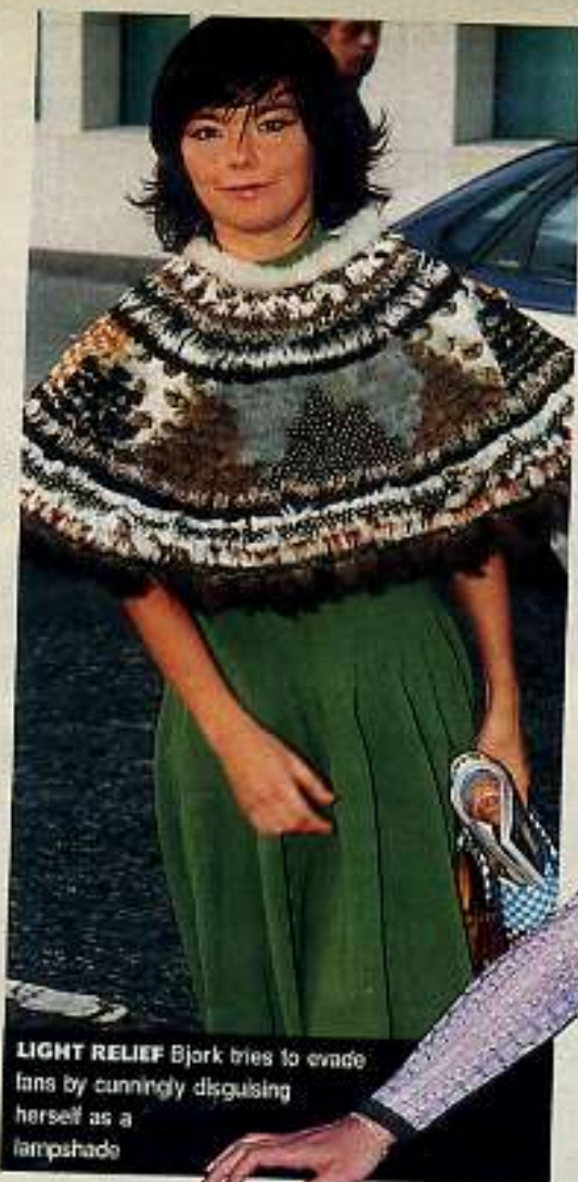
LIGHT RELIEF Björk tries to evade fans by cunningly disguising herself as a lampshade