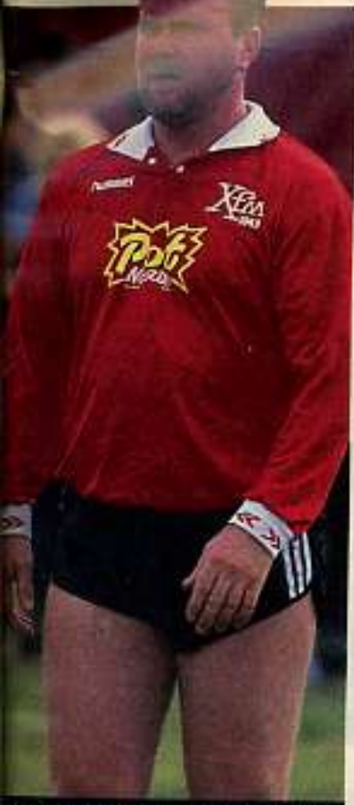
FASHION VICTIM: Is EastEnders Phil set to score with the ladies? Fat chance.