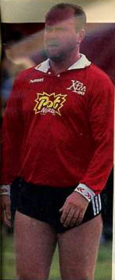
FASHION VICTIM: Is EastEnders Phil set to score with the ladies? Fat chance.