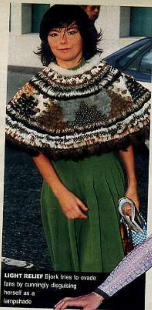
LIGHT RELIEF Bjork tries to evade fans by cunningly disguising herself as a lampshade