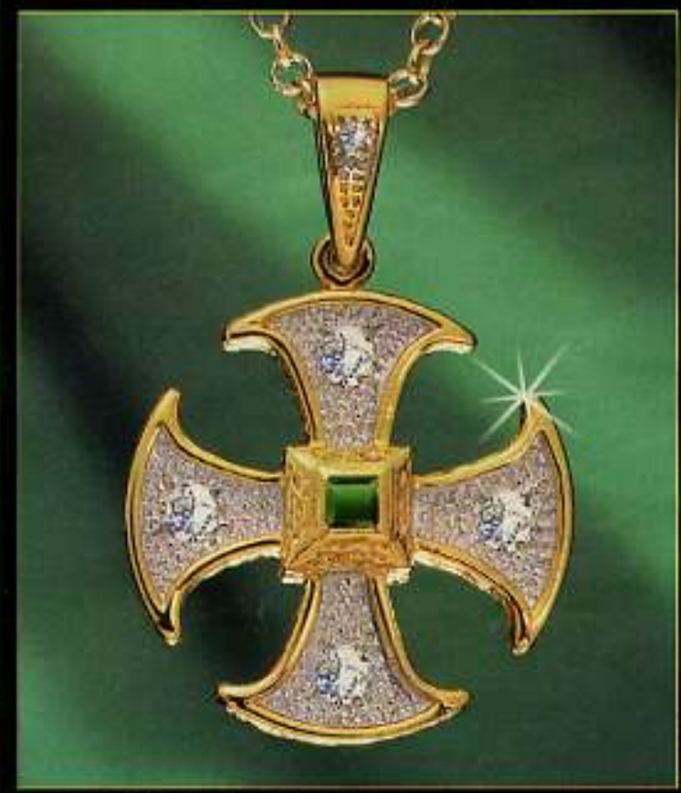
Pendant shown larger than actual size of 1 1/2" (40mm) high.

Inspired by the story of St. Augustine on the 1400th anniversary of his arrival at Canterbury