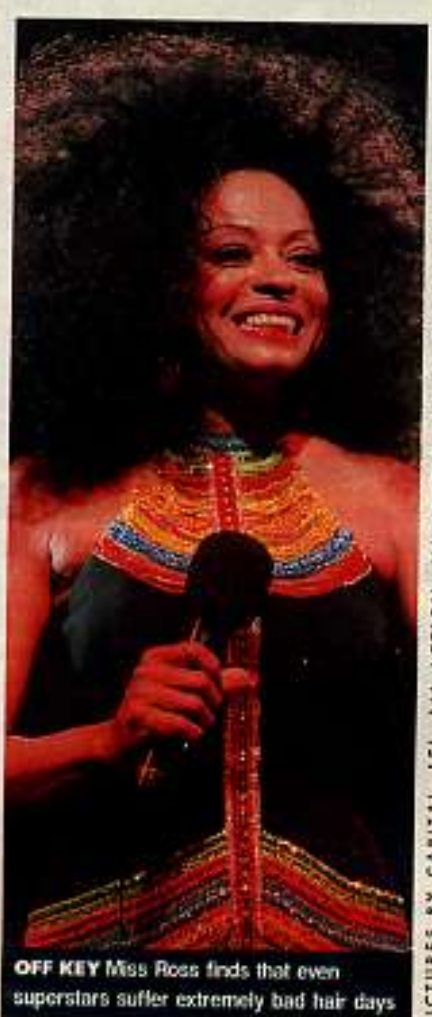
OFF KEY Miss Ross finds that even superstars suffer extremely bad hair days