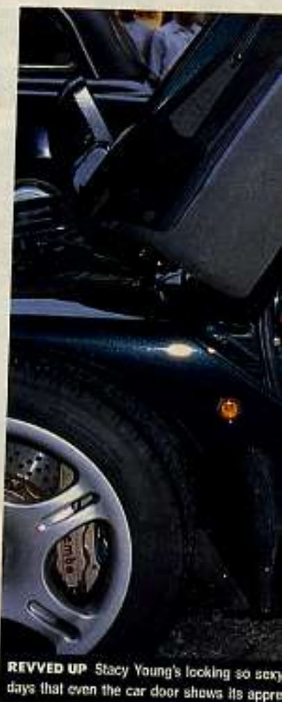
REVVED UP Stacy Young's looking so sexy days that even the car door shows its appre