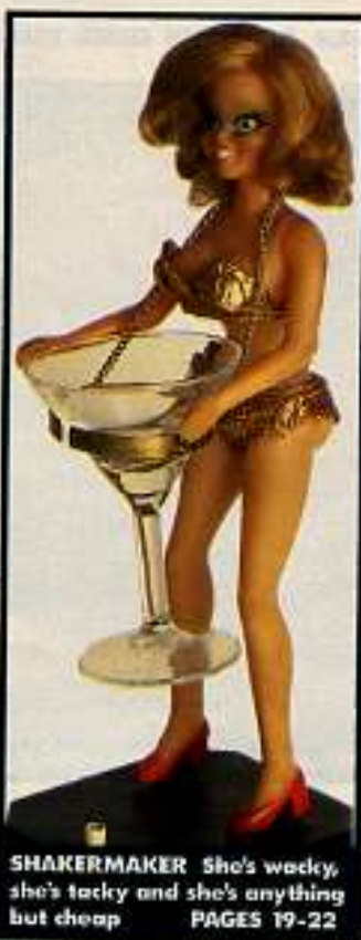
SHAKERMAKER She's wacky, she's tacky and she's anything but cheap PAGES 19-22

Be a flirty flower girl in these alluring floral undies