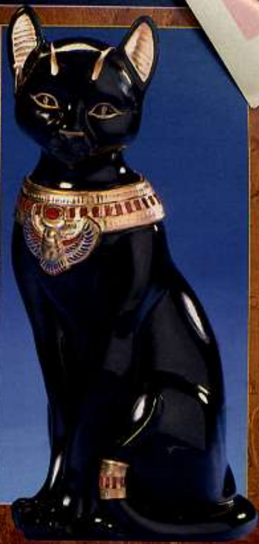
Shown approximately actual size of 51" (130cm) high

The timeless myths and legends of Ancient Egypt inspire a brand new work of art